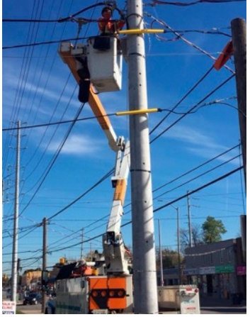
Enersource crews at work